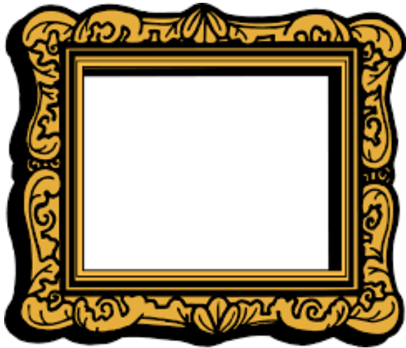
Framed photo of the Great Fish

landing back in the water, never to be seen again. The rock bass had some impressive tooth marks, and Mark's fingers were a bit cut up. We are still amazed at the situation, the size of the fish, and our stupidity at not having taken a photo!!! Laura Giffin, North Turtle Lake