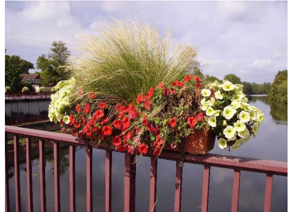
Laura Giffin, North Turtle Lake

Also, many thanks to tenders of the bridge flower boxes. I'll send out a schedule like I did last Spring and if you are not able to help, we hope others will step up to take your week! The flowers make such a lovely addition to our road between North and South Turtle.