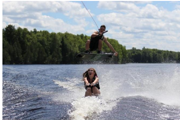
Remember to Duck