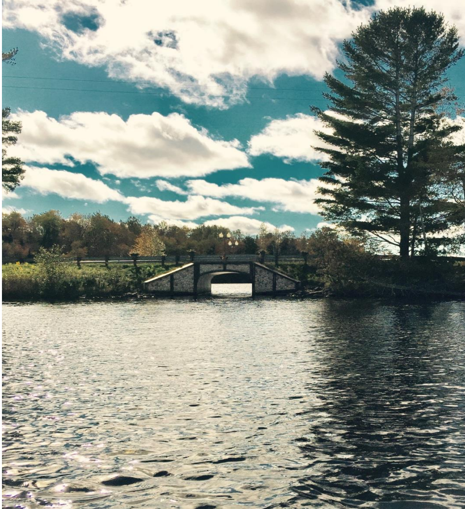
View of the Divide from North Turtle Lake October 2016