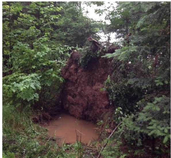
New Swimming Hole Klotz Family Album, Rock Lake