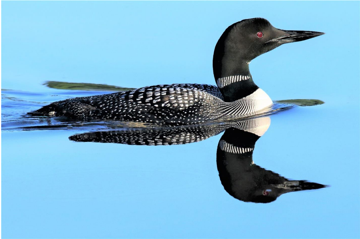
Up or Down - A Strong Sense of Direction