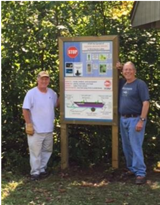
TLCA CBCW Inspectors at the Rock Creek Boat Landing

law in Wisconsin as well as looking for aquatic plant hitchhikers on boats and trailers. The CBCW program is one of our premier prevention efforts. We plan to be at the Turtle Chain boat landings periodically during the summer, especially during heavy use weekends. So far, the Turtle Chain has avoided any infestations of curly leaf pond weed or other aggressive AIS that are in the area. We would like to maintain that status.